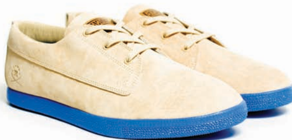
DUNE / DUNE / FRESH BLUE