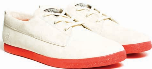
SPRAY / SPRAY / AERO RED