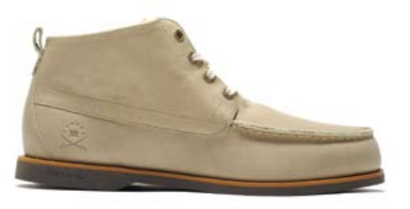
Art no. (U43061)