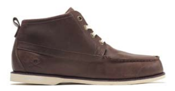
Art no. (U43060)

NEW NAVY / NEW NAVY / LIGHT BONE DELIVERY DATE. 01.10.10