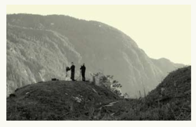
Go forth onto the never ending path

In the third installment of the ongoing collection, Ransom by adidas continues upon its established program as well as bringing forth three new silhouettes to update the winter offering. New materials are brought into play to suit the season, heavy duty oiled leathers and waxed canvases are utilized to better serve the elements at play. In addition, wools are used for a touch of warmth