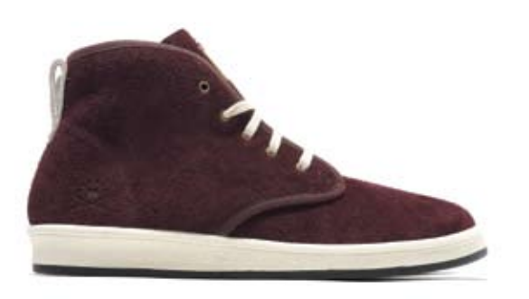
Art no. (U43371)

NEW NAVY / NEW NAVY / CHALK DELIVERY DATE. 01.08.10