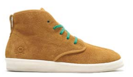
Art no. (U43372)